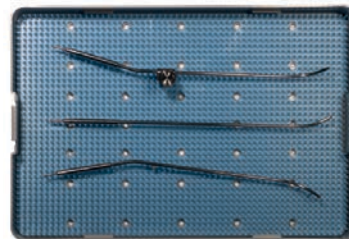
Sterilization box with select 2/3 Channel Endometrial Applicator Combo Set components