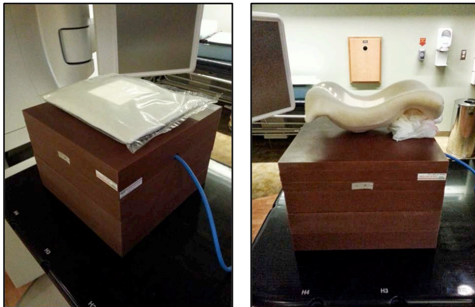
Figure 2 – Transmission measurement setup for new (left) and molded (right) headrest.