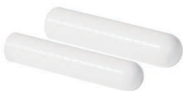
Domed build-up caps

The CT/MR Miami Applicator Set includes standard 30°, 0° and stump configurations to effectively treat a variety of anatomies. The 3.0 cm, 3.5 cm and 4.0 cm build-up cap cylinders and optional domes allow for enhanced source spacing, and the 7-channel design enables more precise dose distribution around circumference of the vagina.