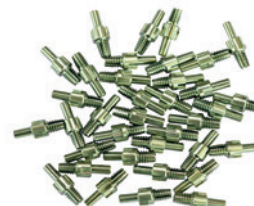
Template needle collets