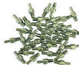
Template needle collets