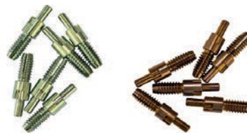
Obturator needle collets